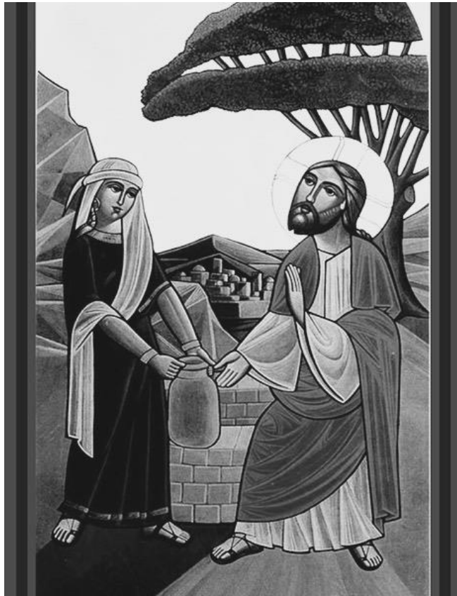
Jesus and the Samaritan Woman